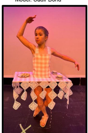
A Table for Two Designer: Kaia Ranston