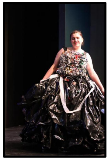
Flowing Floral Frock Designer: Sofia Strong