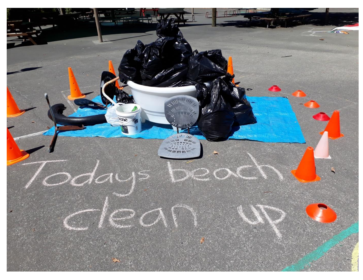
"It's sad, it's bad, and it makes us mad!"