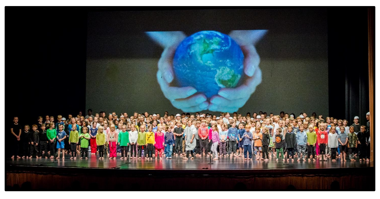
The last School production held at the Municipal Theatre in 2017

The key dates for the production are the 16 and 17 September. We will be spending both days at the Municipal Theatre, having a matinee and an evening performance on 17 September. This will be something you will not want to miss!!