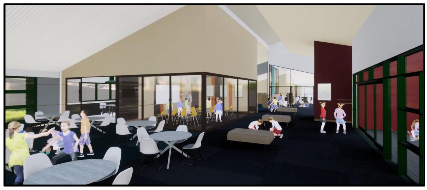
A view from inside one of the teaching spaces.