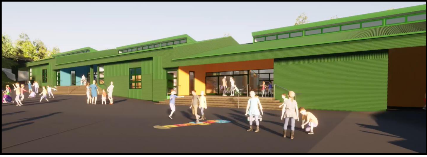
New classroom Block view from the quad area.