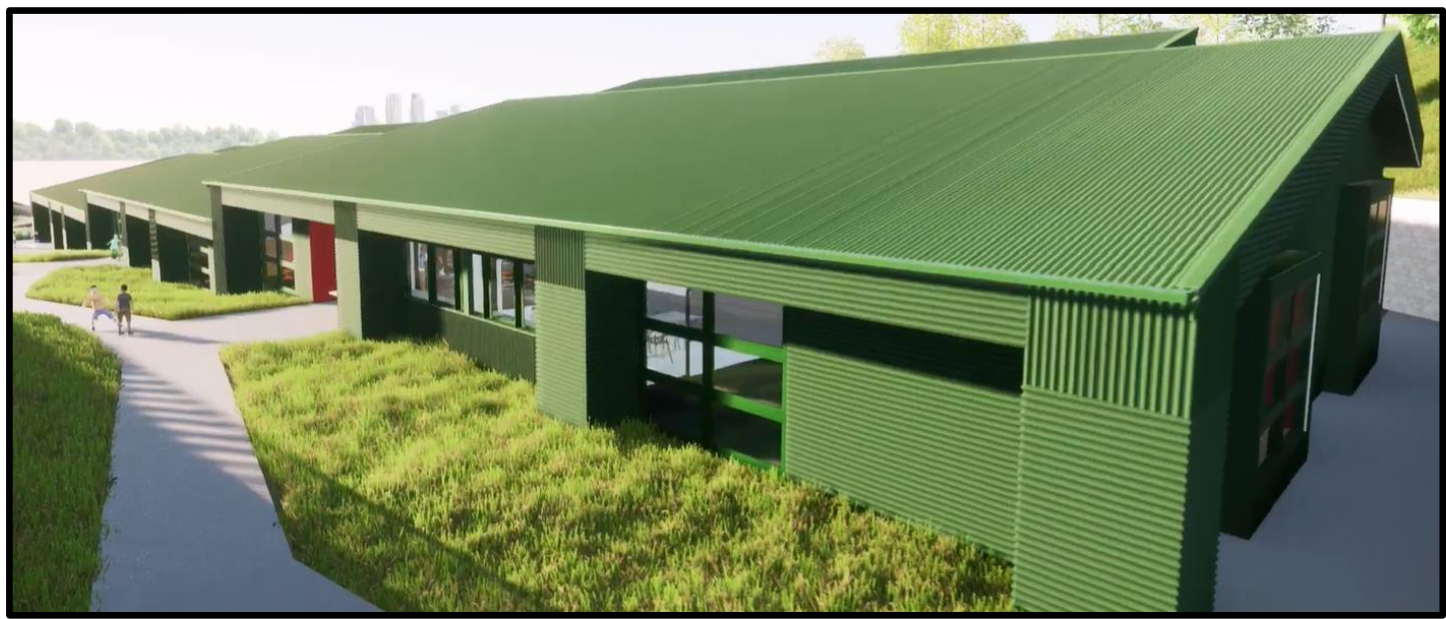
New Classroom Block view from Hill Road (Southern end- looking to the North)