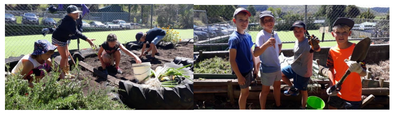
Term One's specialist composting team!